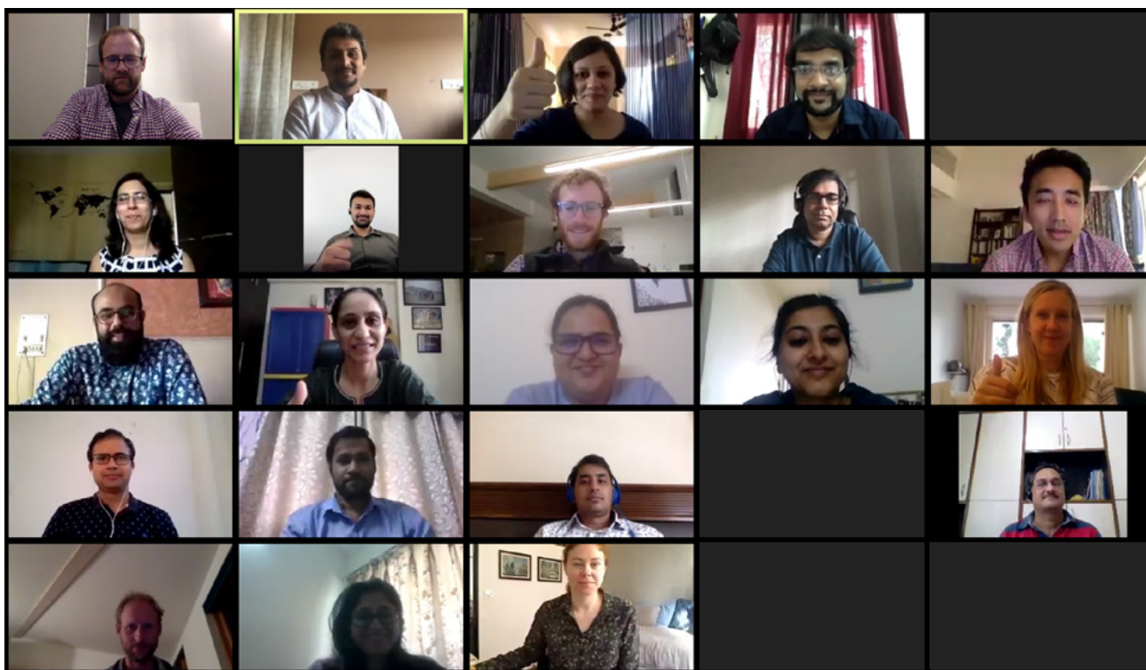
Nearly 40 participants from 16 organizations participated in the 11 th June 2020 virtual facilitated e-workshop